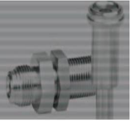
Long Gland Female CLGF